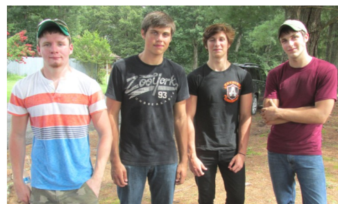
Free Food & Good Music