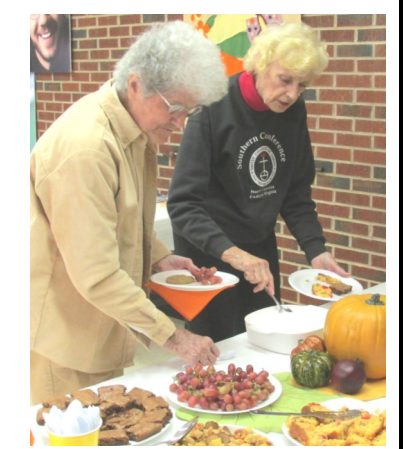
Senior Fall Outing 2013