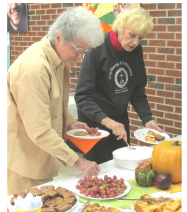
Senior Fall Outing 2013